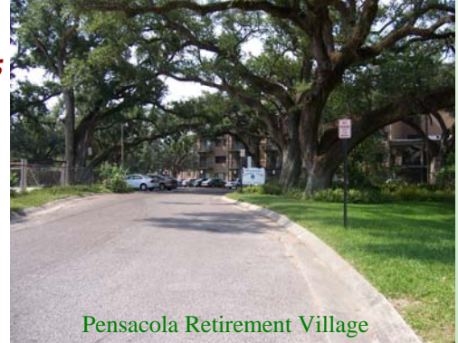
Pensacola Retirement Village

Together we can address the Environmental needs of the community.